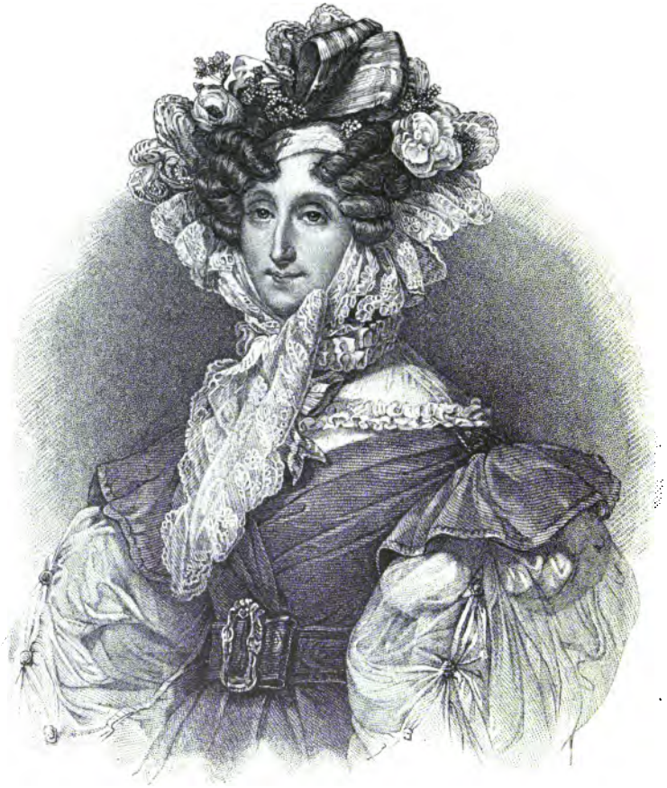
MARIE AMÉLIE QUEEN OF THE FRENCH